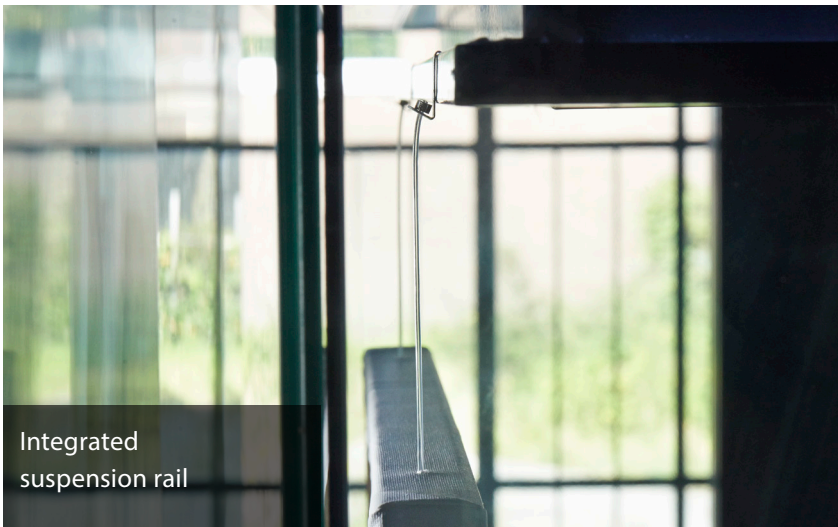
Integrated suspension rail